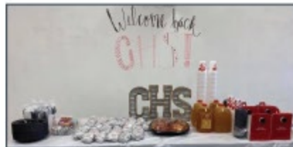
RiverFall welcomed teachers back with breakfast from Chick-fil-A!

We look forward to connecting with these high school students in creative ways, with a special focus on financial education and workforce readiness skills. Be on the lookout for more updates to come!