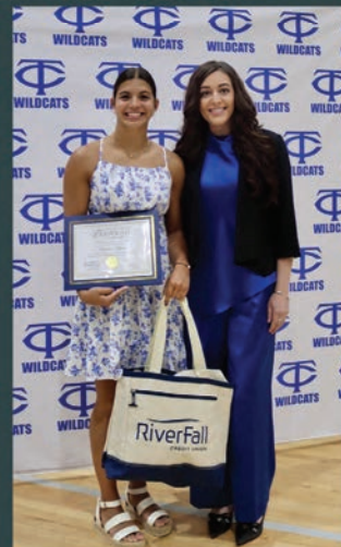
Tuscaloosa County High School Mississippi State University

We appreciate the opportunity to have joined in celebrating them and their achievements! We wish them, as well as the entire graduating class of 2025, all the best in their future endeavors.