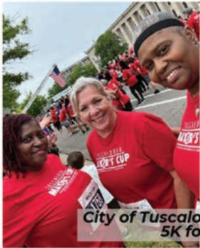
City of Tuscaloosa Mayor's Cup 5K for Pre-K

We also enjoyed creating our "money tree" egg for the Northport Bunny Trail hosted by Junior League Tuscaloosa.