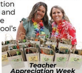
Teacher Appreciation Week

We are thrilled to share the meaningful impact we've had by rejoining the Adopt-A-School program this past year. Our partnership with Echols Middle School has been incredibly rewarding, and together we've worked to promote and advance the pillars of education in a variety of ways. We sponsored Student of the Month pizza parties, treated students with donuts for their quarterly perfect attendance, and helped support the first ever ACAP Celebration. We recognized all teachers and support staff members during Teacher Appreciation Week with personalized treat bags and some of our employees also had the opportunity to volunteer at the school's baseball field concession stand. We are already looking forward to building on this momentum and accomplishing even more in the 2025-'26 school year!