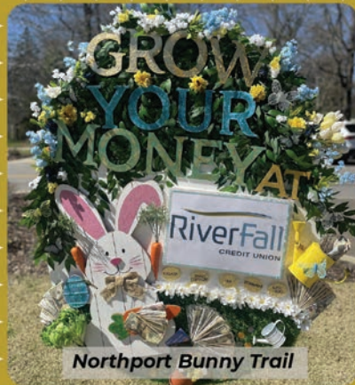
Northport Bunny Trail